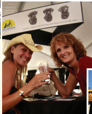
Beating the heat with Labrador Sauvignon Blanc