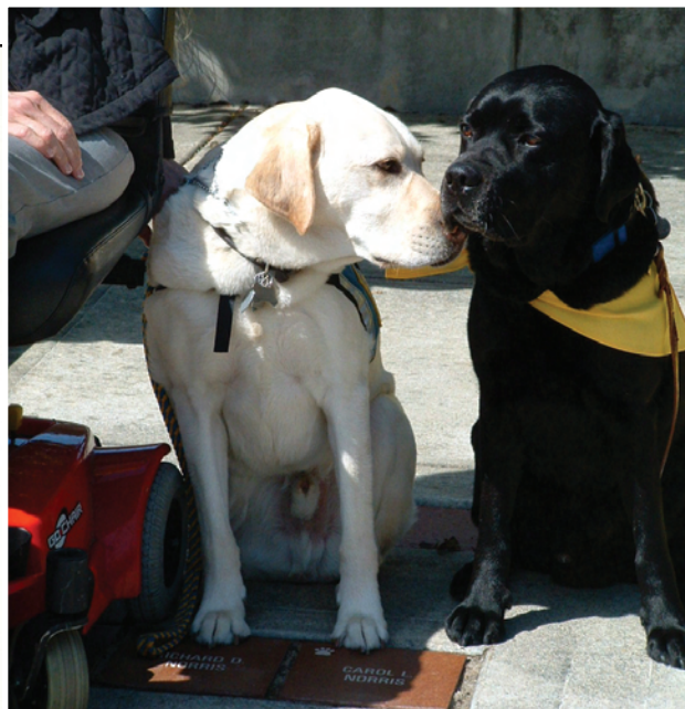
Lucky meets Dad, Baumann in Santa Rosa, April 08