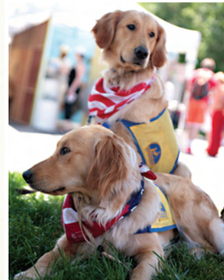
CCI assistance dogs-in-training enjoying the shade