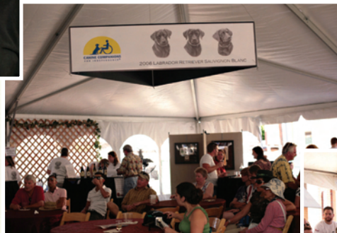
Enjoying the wine, art and jazz