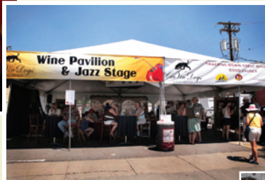
The CVD Wine and Jazz Pavilion provides a nice respite