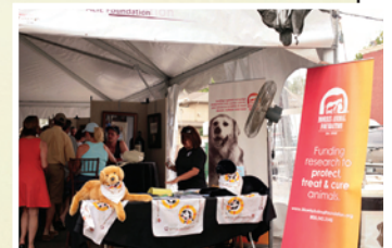
Morris Animal Foundation's table on Saturday