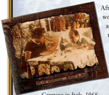
Camping in Italy, 1968